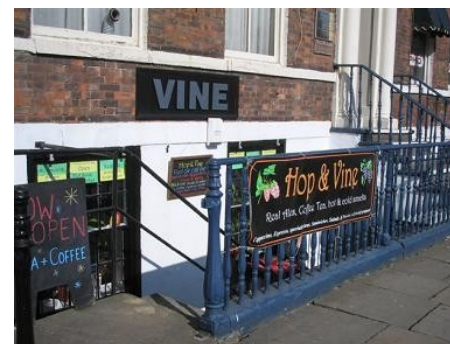
Hop & Vine